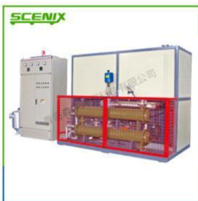
Electrical Heating Oil Heat Furnace