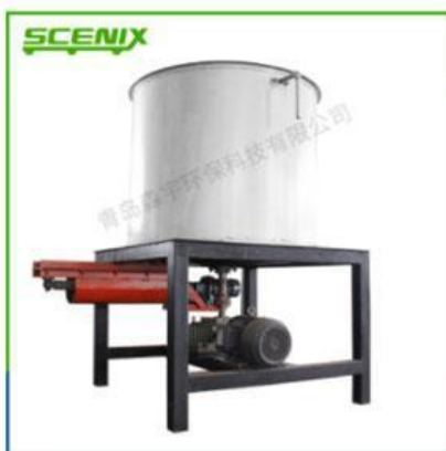
Glue mixing machine